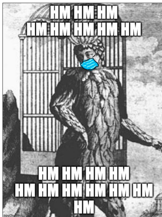
Figure 1: “Papageno in 2020”. u/zchwalz 2020 ‘Papageno in 2020’, Reddit. 26 May.

This picture (see Figure 1 ), based on the original print of the libretto to Die Zauberflöte , and portraying Emanuel Schikaneder in the role of Papageno, was added by user zchwalz to the subreddit ‘r/ClassicalMemes’ on 26 May 2020 with the caption ‘Papageno in 2020’ (u/zchwalz, 2020). The overt message is, in a way, simple: due to face mask regulations, a song will sound very different, more like humming perhaps. However, to interlocutors with further subject competence, this meme suggests other