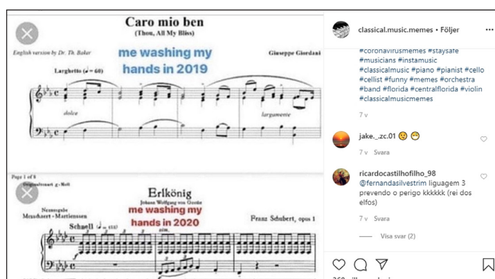
Figure 3: Washing hands in 2019 compared to 2020. classical.music.memes 2020 ‘Me washing my hands’, Instagram. 14 March.

The use of notation as a graphic way to describe non-musical phenomena is a recurring theme in classical music memes. Sheet music, not surprisingly a common feature in classical music memes, can be used to comment on social structures within