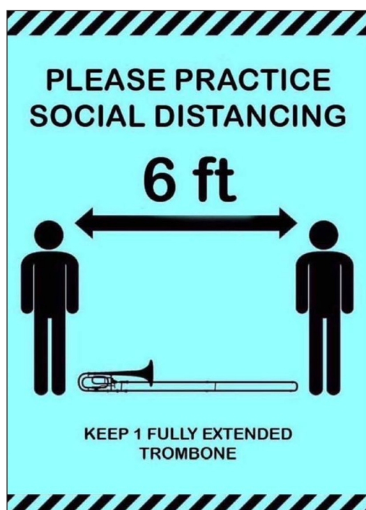
Figure 4: Social distancing using trombones. Classical Music Humor 2020a ‘Please practice social distancing’, Facebook. 15 June.

Hygiene and distancing recommendations are thus in various ways brought into the language of classical music memes. Even if the primary aim of these memes is to entertain, they also disseminate health information. The fully extended trombone (please see Figure 4 ) or hand washing to ‘An die Freude’ work as ‘translations’ of health information from a public health discourse – that is, an objective, informative and not very entertaining tone – to a classical music meme discourse where entertainment is pivotal and, like much other humour, arises from the clash between different discourses.