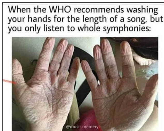
Figure 2: Hand washing to whole symphonies. Classical Music Humor 2020b 'When the WHO recommends washing', Facebook. 17 April.